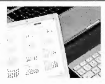
Time, Task & Email Management for Lawyers and Staff March 8 (rebroadcast)